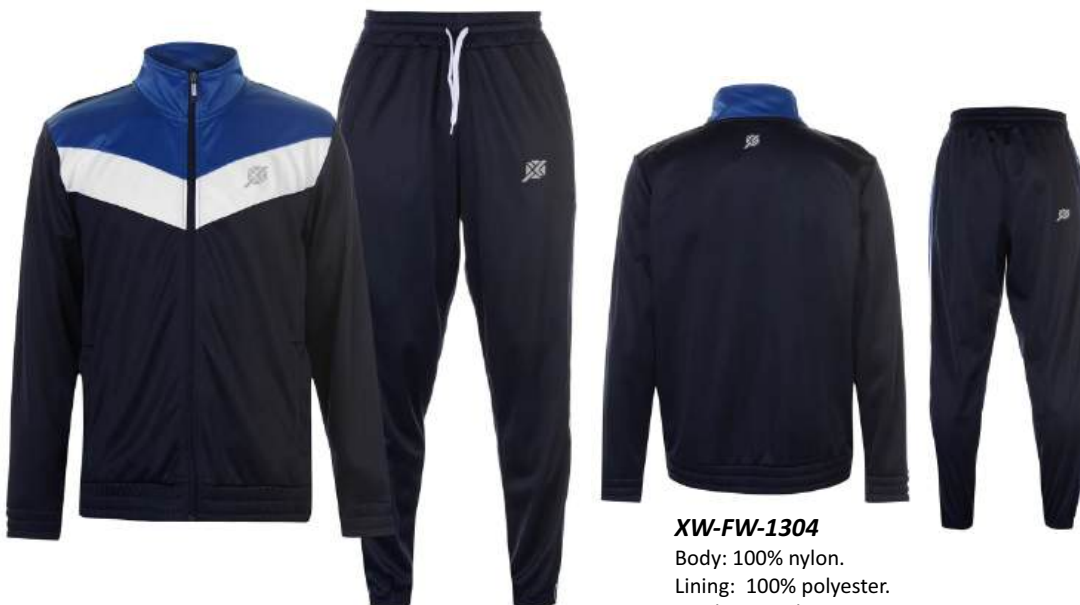
XW-FW-1304 Body: 100% nylon. Lining: 100% polyester. Machine wash.