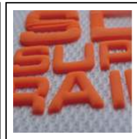
Silicon 3D Printing