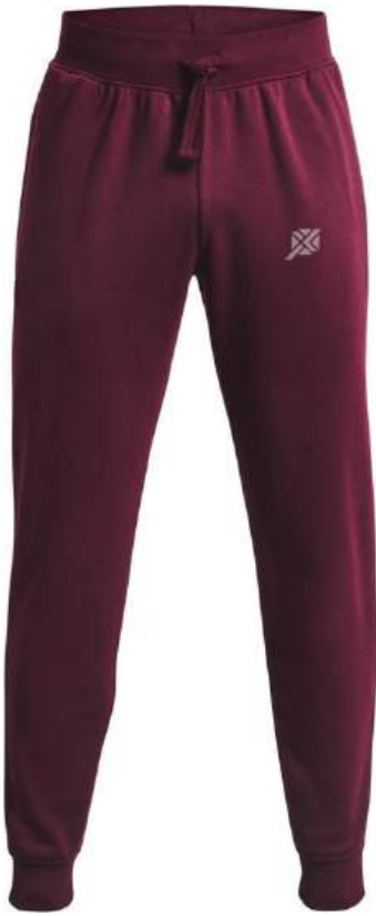
XW-FW-1401 Standard fit for a relaxed, easy feel Stretch cuffs Pockets 61% cotton/39% polyester Machine wash

Worldwide Delivery In Bulk Order | Sublimation, Embroidery, Printing | 100% Customization