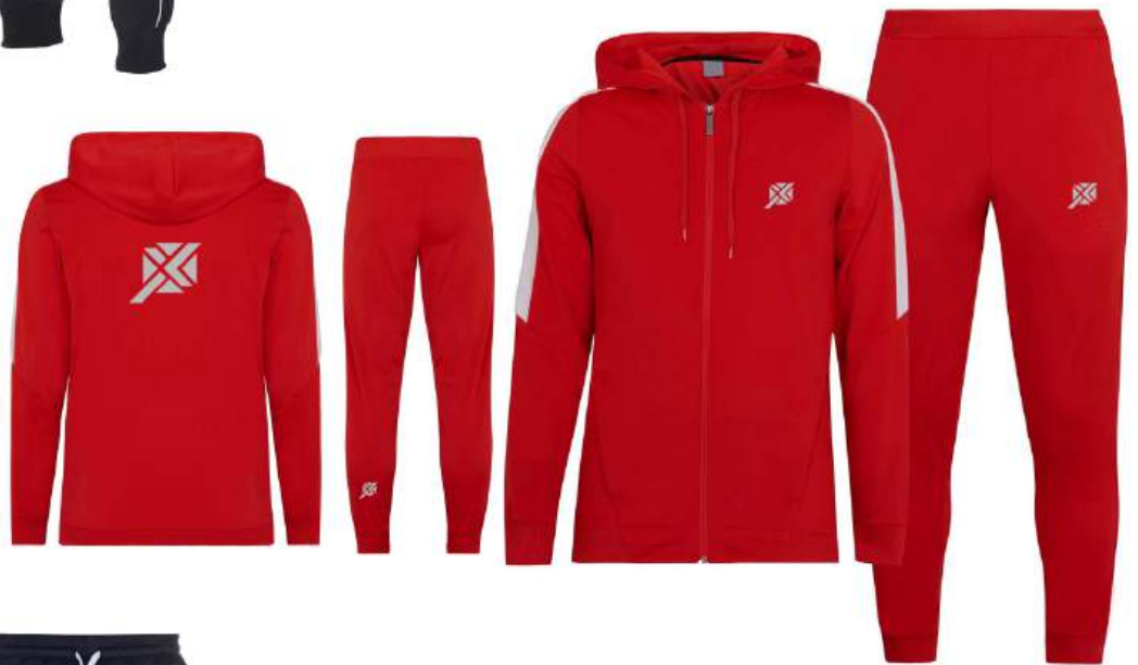
XW-FW-1303 Body: 100% nylon. Lining: 100% polyester. Machine wash.