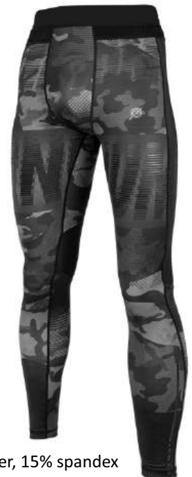
XW-CW-3006 Spat 85% polyester, 15% spandex