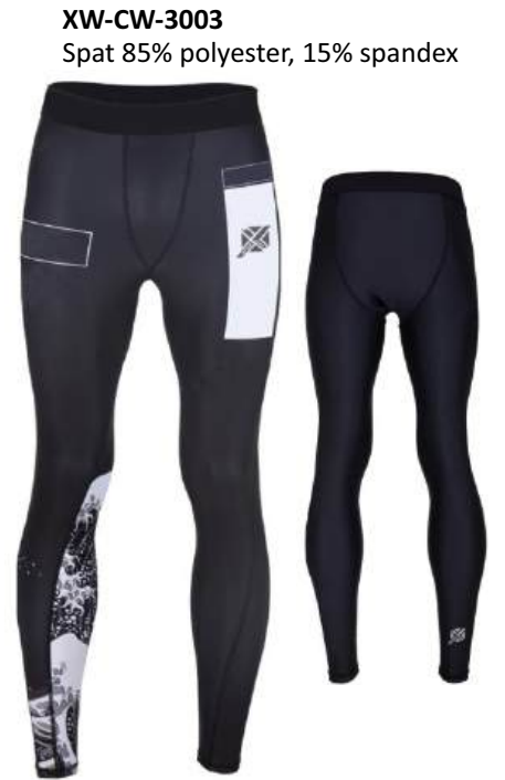
XW-CW-3003 Spat 85% polyester, 15% spandex