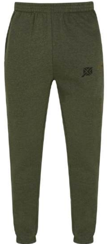
XW-FW-1404 61% cotton/39% polyeste Machine wash

PRODUCT SELECTION GUIDE // MANUFACTURER & EXPORTER