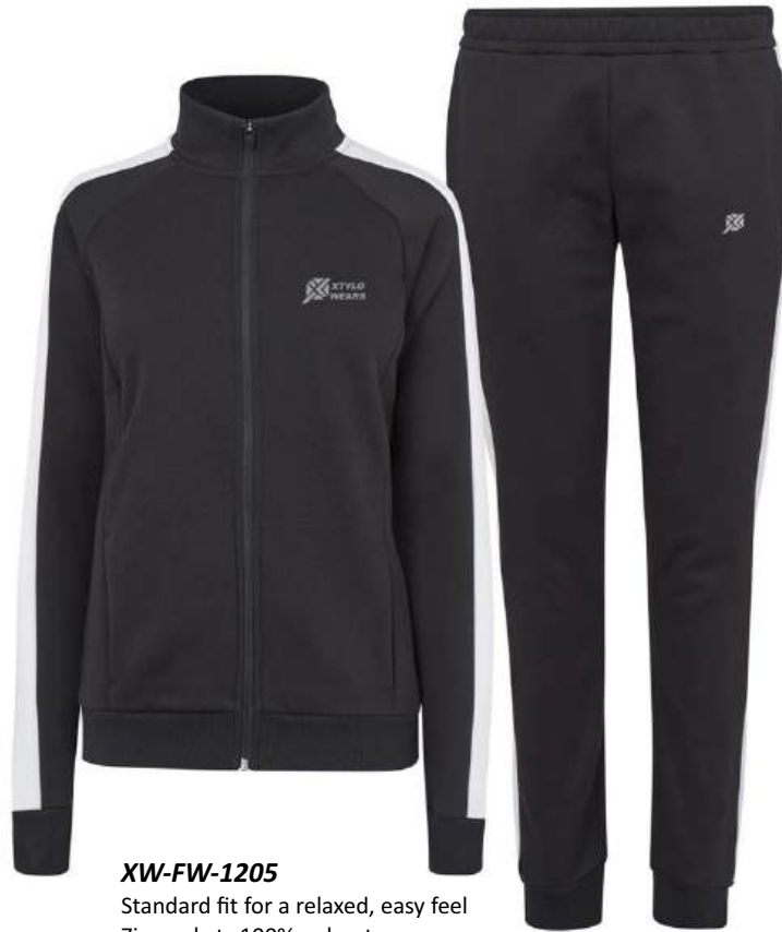
XW-FW-1205 Standard fit for a relaxed, easy feel Zip pockets 100% polyester Machine wash

Worldwide Delivery In Bulk Order | Sublimation, Embroidery, Printing | 100% Customization