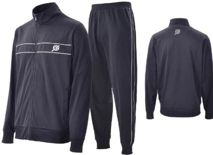
XW-FW-1302 Body: 100% nylon Lining: 100% polyester. Machine wash.

Worldwide Delivery In Bulk Order | Sublimation, Embroidery, Printing | 100% Customization