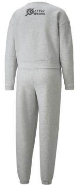
XW-FW-1204 Standard fit for a relaxed, easy feel Zip pockets 100% polyester Machine wash

PRODUCT SELECTION GUIDE // MANUFACTURER & EXPORTER