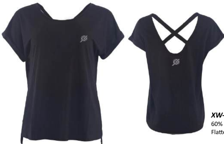
XW-FW-1506 60% Cotton, 40% Polyester Machine Wash Flattering V-neck silhouette

PRODUCT SELECTION GUIDE // MANUFACTURER & EXPORTER