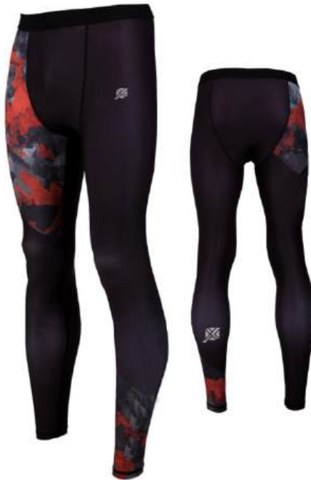
XW-CW-3005 Spat 85% polyester, 15% spandex