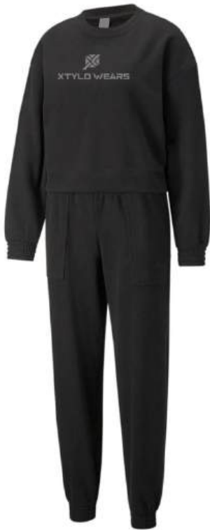
XW-FW-1201 Standard fit for a relaxed, easy feel Zip pockets 100% polyester Machine wash

Worldwide Delivery In Bulk Order | Sublimation, Embroidery, Printing | 100% Customization