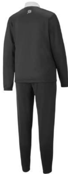
XW-FW-1203 Standard fit for a relaxed, easy feel Zip pockets 100% polyester Machine wash