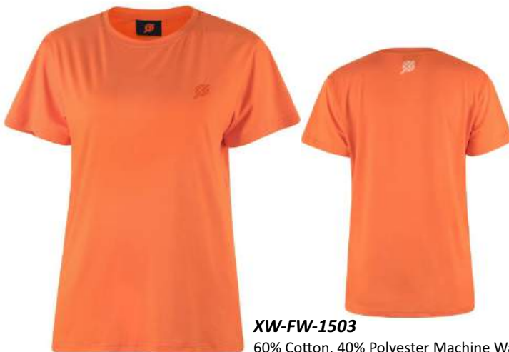
XW-FW-1503 60% Cotton, 40% Polyester Machine Wash Flattering V-neck silhouette