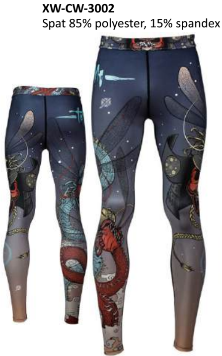
XW-CW-3002 Spat 85% polyester, 15% spandex