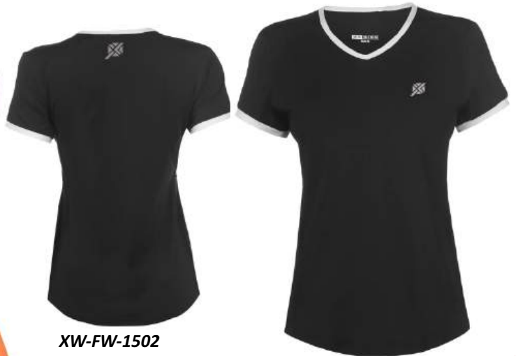
XW-FW-1502 60% Cotton, 40% Polyester Machine Wash Flattering V-neck silhouette