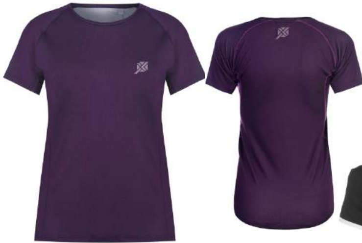
XW-FW-1501 60% Cotton, 40% Polyester Machine Wash Flattering V-neck silhouette

SIZE COLOR MATERIAL MOQ ON CUSTOMER DEMAND