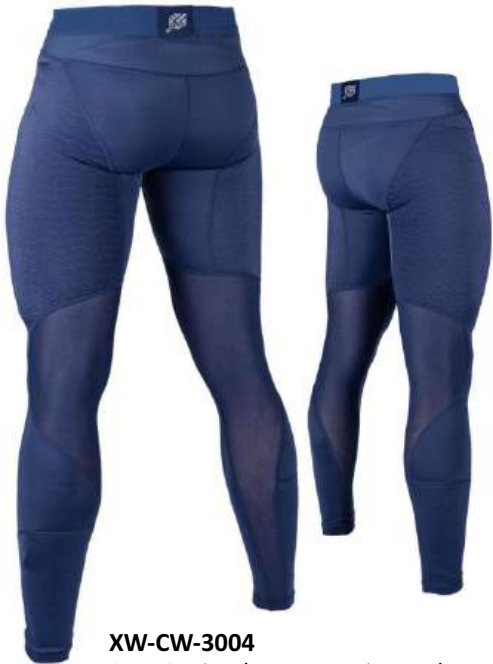
XW-CW-3004 Spat 85% polyester, 15% spandex