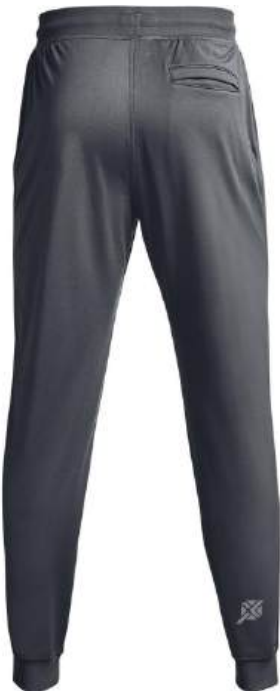
XW-FW-1403 61% cotton/39% polyester Machine wash