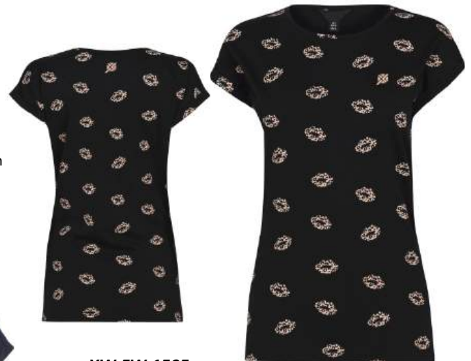
XW-FW-1505 60% Cotton, 40% Polyester Machine Wash Flattering V-neck silhouette