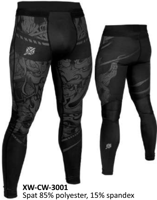
XW-CW-3001 Spat 85% polyester, 15% spandex

Worldwide Delivery In Bulk Order | Sublimation, Embroidery, Printing | 100% Customization