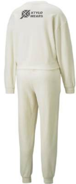
XW-FW-1202 Standard fit for a relaxed, easy feel Zip pockets 100% polyester Machine wash

SIZE COLOR MATERIAL MOQ ON CUSTOMER DEMAND